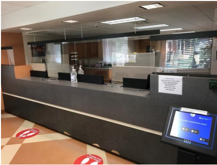
Photo: New Plexiglas barriers and social distance markers at the Midland-Odessa RSC